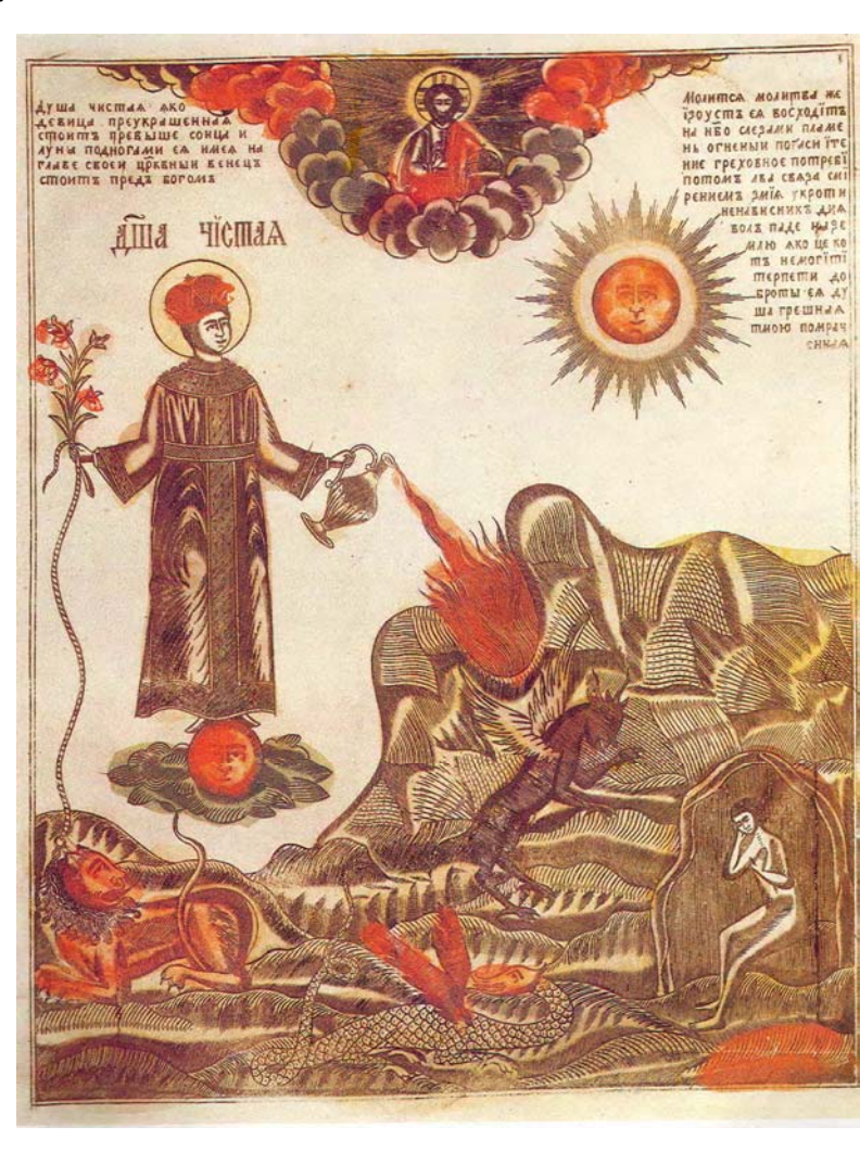
95: The Pure Soul (second quarter of the 19<sup>th</sup> century)